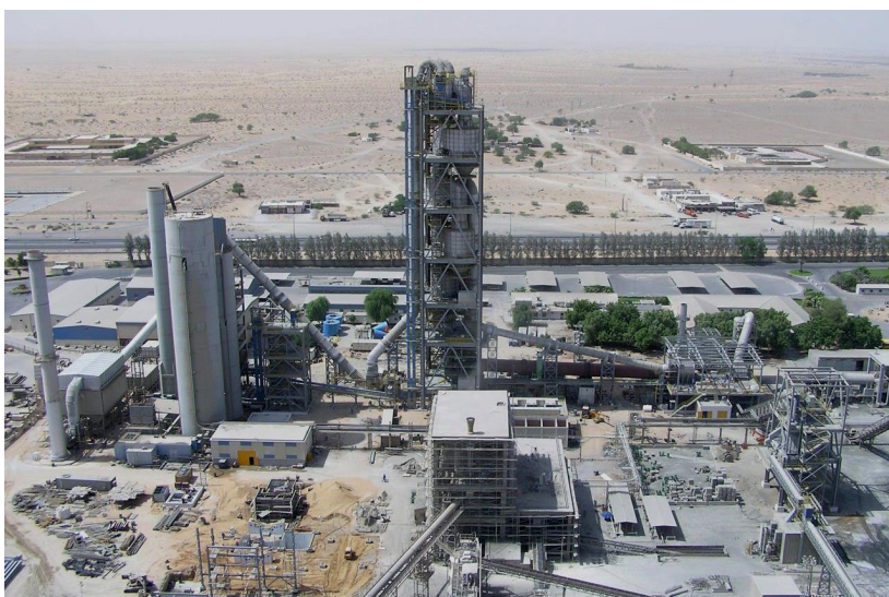
6 Sharjah UAE Kiln upgrade from 800 to 2200 t/d