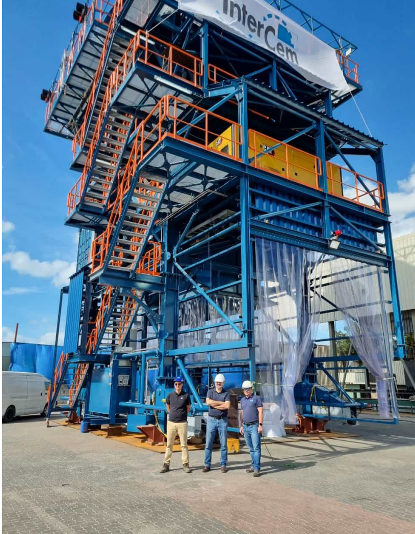
5 InterHop – raw material receiving hopper