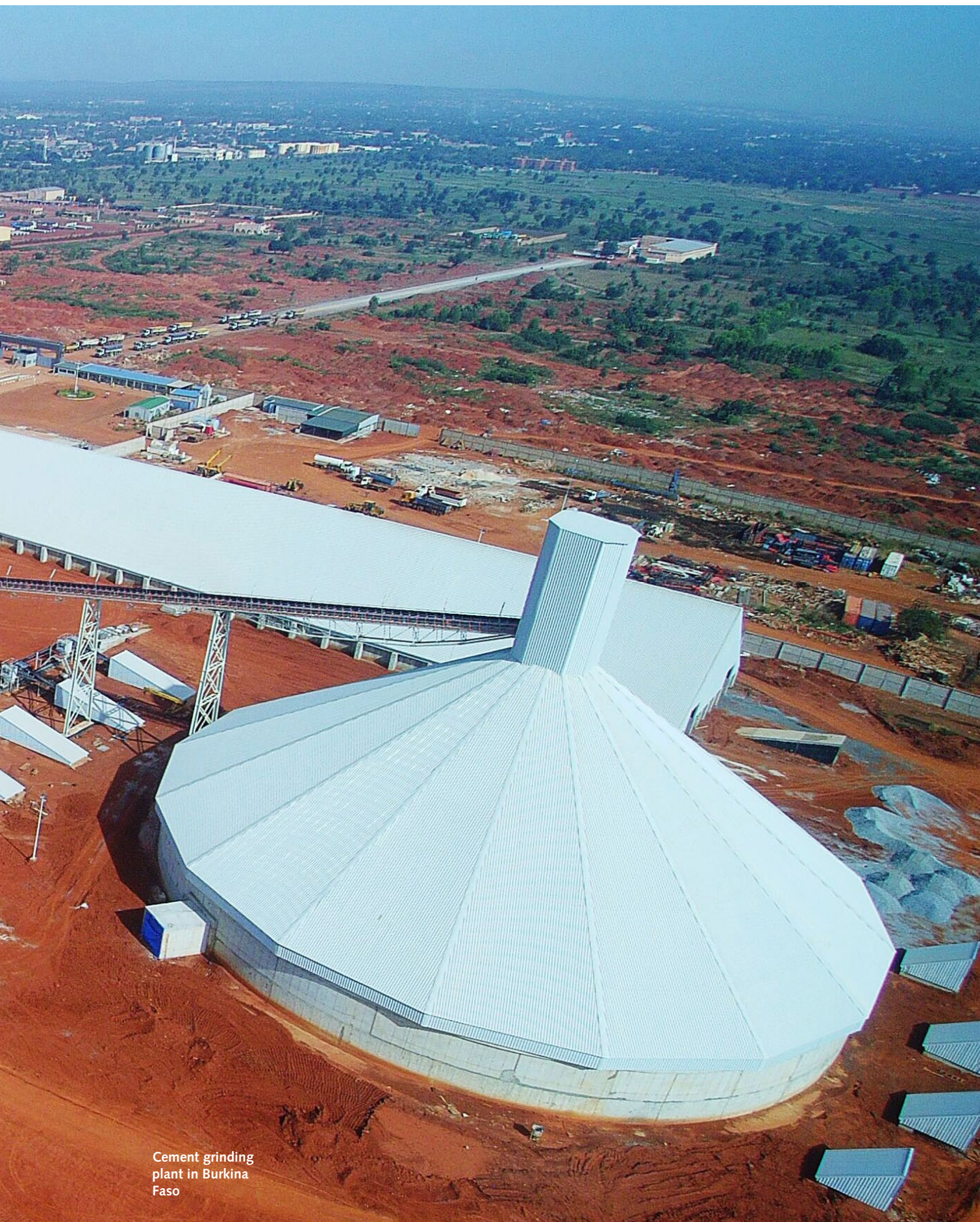
Cement grinding plant in Burkina Faso