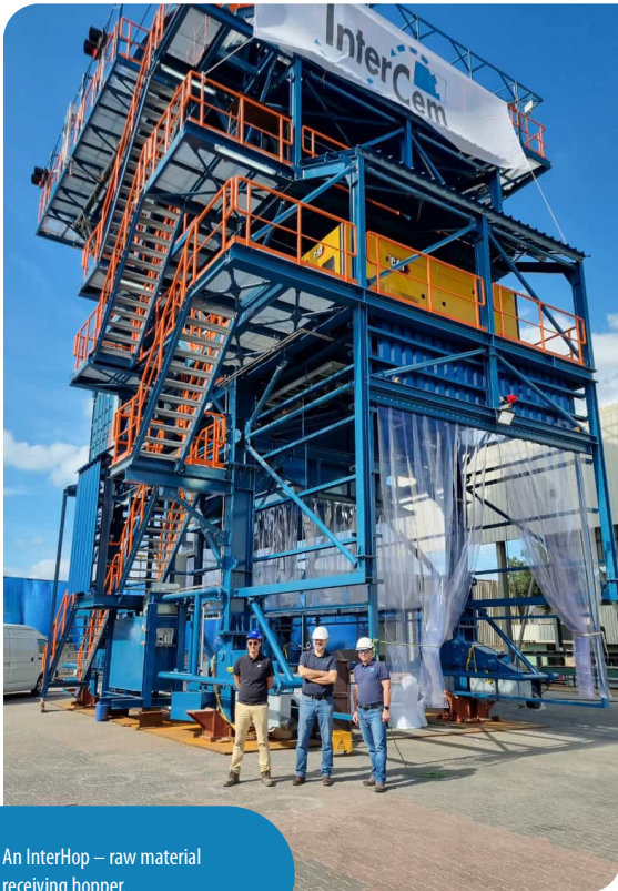
An InterHop – raw material receiving hopper.