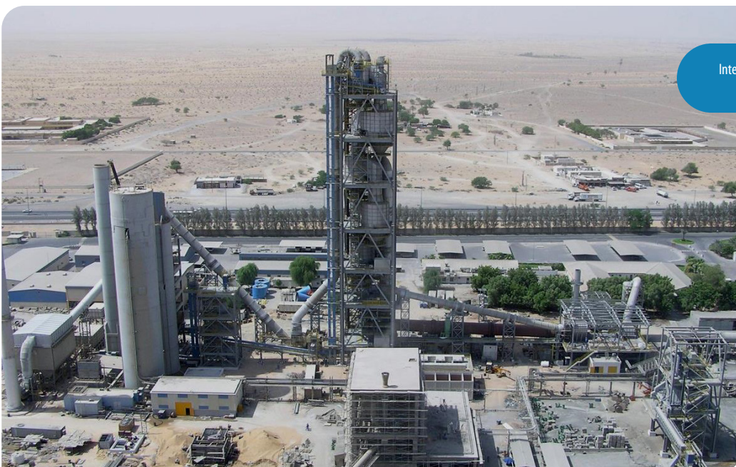
Intercem Engineering upgraded a cement plant in Sharjah, UAE, from 800t/day to 2200t/day.