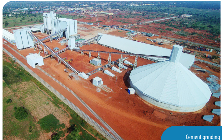
Cement grinding plant in Burkina Faso.

Thanks to decades of experience and an international network, Intercem offers its customers a comprehensive range of services in cement plant construction from a single source. The available, tailor-made spectrum ranges from individual components to upgrades of existing plants